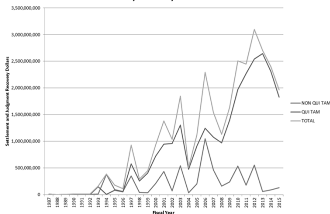
Settlement and Judgment Recovery Dollars by FY - HHS Cases