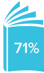
Conflicts of Interest