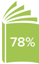
Board’s Role in Compliance