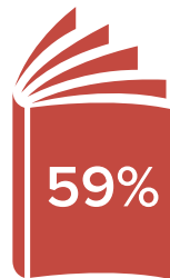
Specific Legal Issues