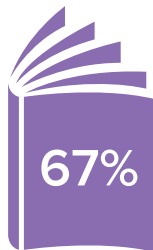
Overall Government Expectations for Compliance Programs